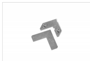
Lockset simple with allen key FK-0218