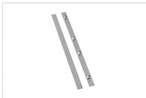
Extension set Eco/Simple FK-0510