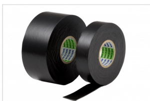
Nitto tape FK-8815