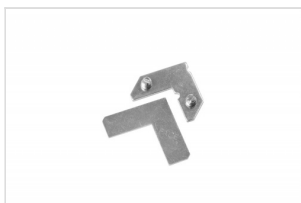
Lockset simple FK-0210