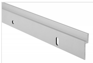
Cleathanger 20 FK-8020